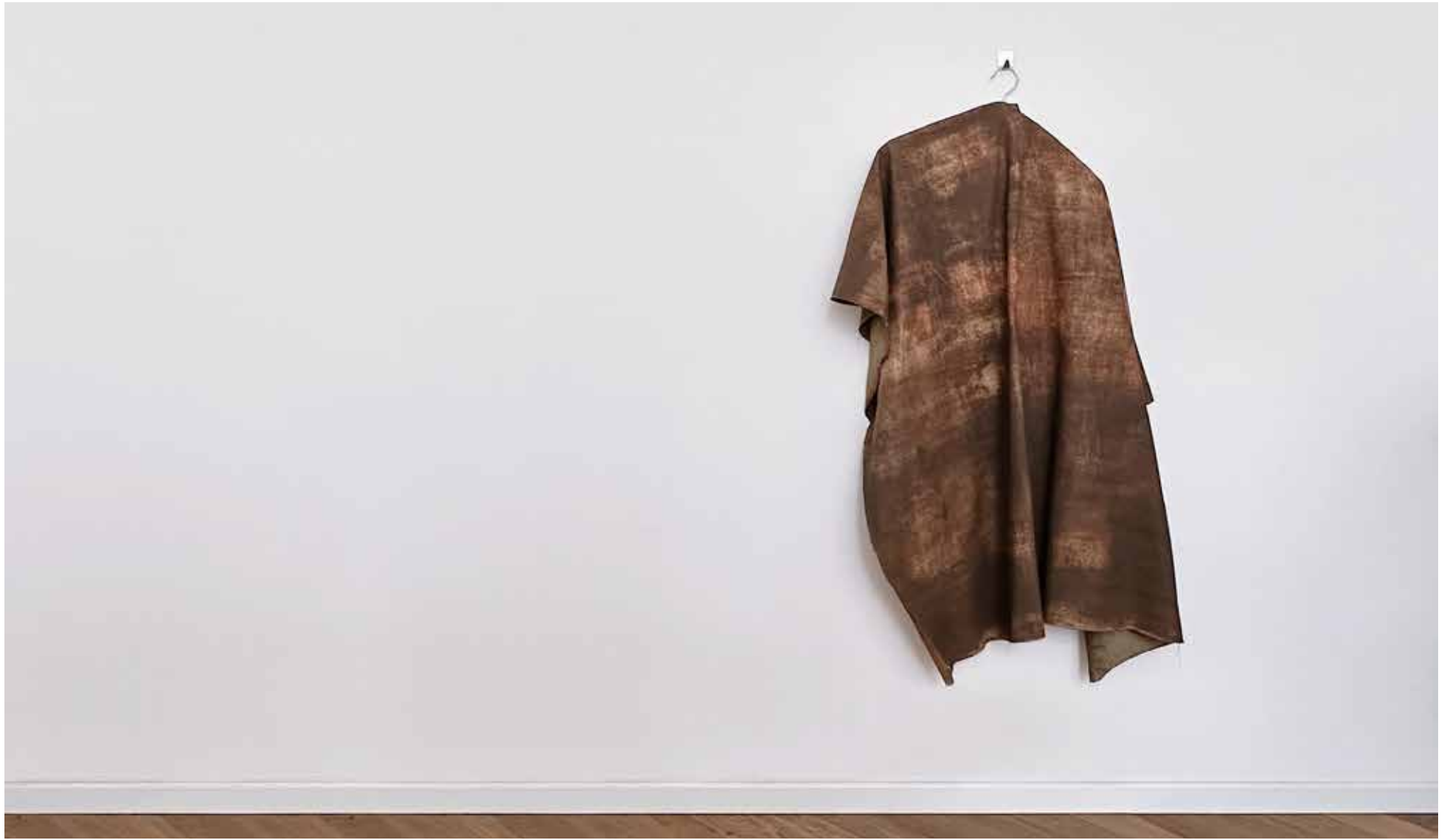
HOME. City as a System of Supports 2026—